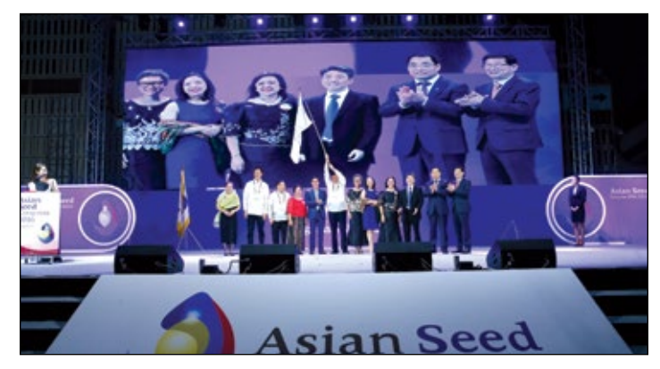
Traditional flag waving ceremony to confirm the hosts of ASC 2017

Every year, the ASC is held in a new host country within the APSA territory. This year's flag-waving ceremony welcomed to stage a delegation on behalf of the Philippines Seed Industry