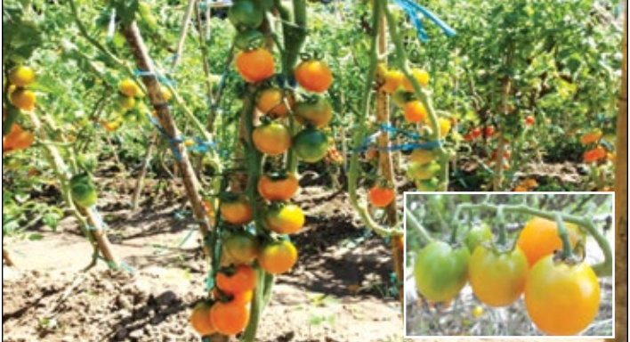
New cherry tomato variety "Rio Gold" released by the Ministry of Agriculture, Govt. of Fiji