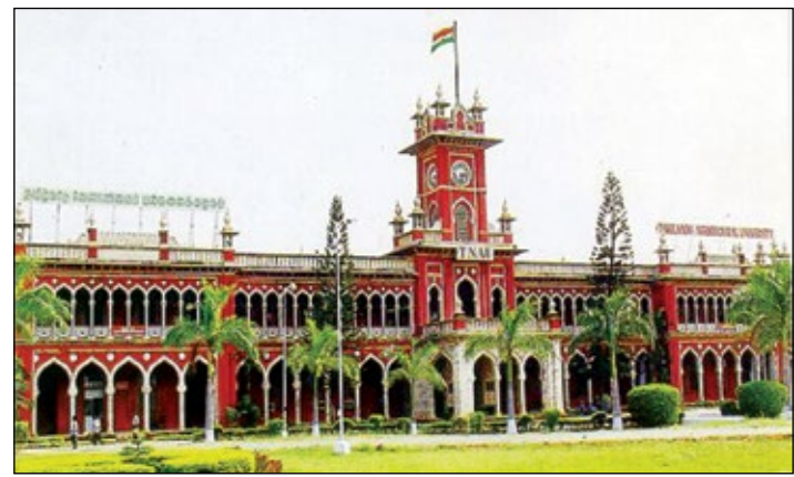
Administrative Block of TNAU, Coimbatore

In 1868, a full-fledged public agricultural school was started at Saidapet, Chennai, India for the purpose of training young people in different branches of agriculture. The school was transferred to the control of the Director of Public Instructions in 1884 to achieve stability and controlled development in