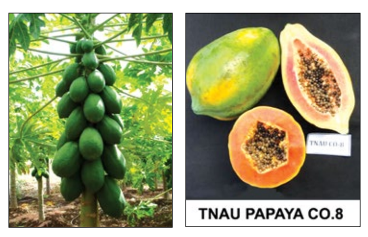
CO 8: A high yielding and better quality variety of papaya

This variety was released during the year 2012. Its special features include: i) unique red pulped dioecious variety (most dioecious varieties are yellow pulped); ii) high yield potential (230 t/ha) in a duration of 20-22 months; iii) better pulp quality (TSS 13.5%); iv) ideally suited for production of fresh fruits