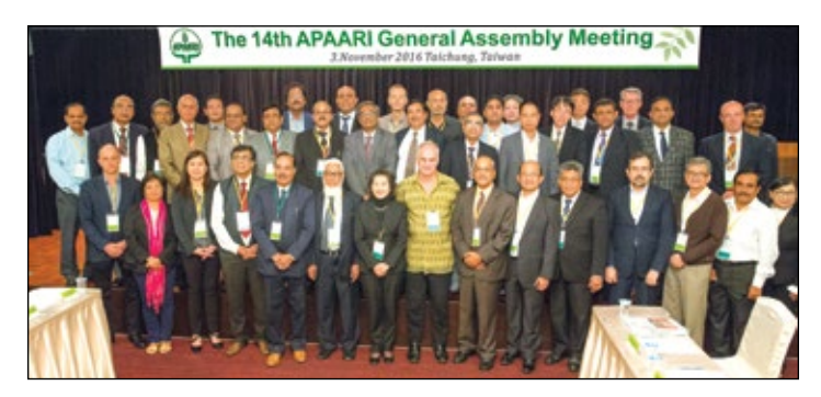
Participants of 14th APAARI General Assembly Meeting, Taiwan

The 14th General Assembly Meeting (GAM) of APAARI was hosted by the Council of Agriculture (COA) and held at the Hotel National, in Taichung, Taiwan on 3 November 2016. Forty six members, partners, special invitees and APAARI staff and consultants participated in the meeting.