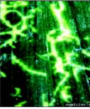
Adult coconut scale insect