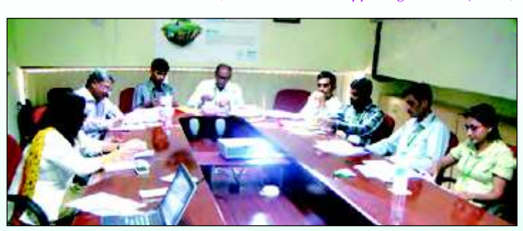
Participants of the training program