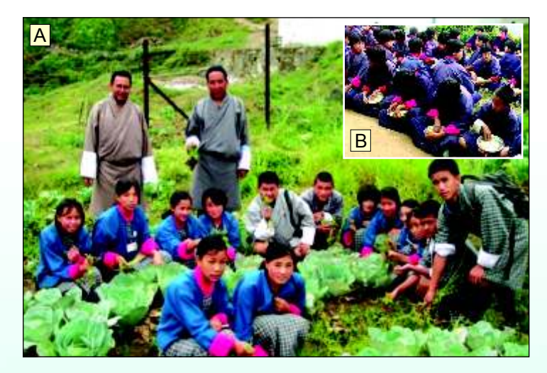
A. The agriculture plot in the school: "enjoying the fruits of their labour" B. School feeding supplemented by SAP

Her Royal Highness Princess Maha Chakri Sirindhorn of Thailand who is also a goodwill ambassador to WFP is supporting SAP in three schools in Bhutan. The Thai experiences adding value to the program involve the post-harvest processing of food to make vegetables available in the lean season, management of the nutritional health status of the school children by requiring regular monitoring of the weight and height of students. Very important for a developing country like Bhutan which can be replicated is the use of cost effective locally available materials for building simple designed infrastructure required for SAP such as livestock sheds and perimeter fencing.