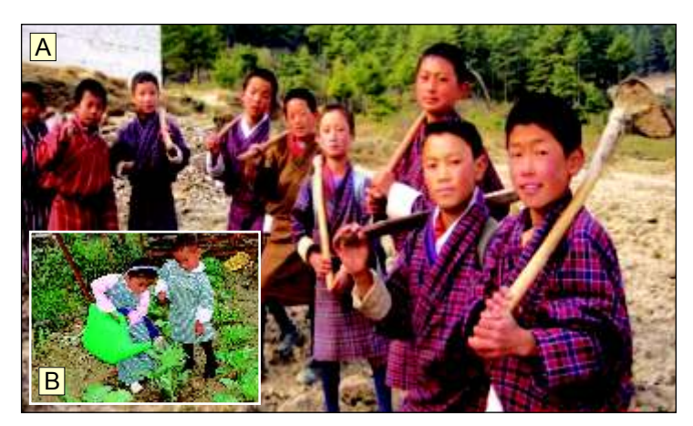
A. Students preparing the land for SAP: "inculcating dignity of labour" B. Children watering SAP plot, "learning by doing"

The objectives of the SAP are many fold. Other than the obvious aspect of "creating awareness and hands-on training in agriculture", it covers concepts such as inculcating the dignity of labour and provides avenues for ideas and skills associated with a means for future