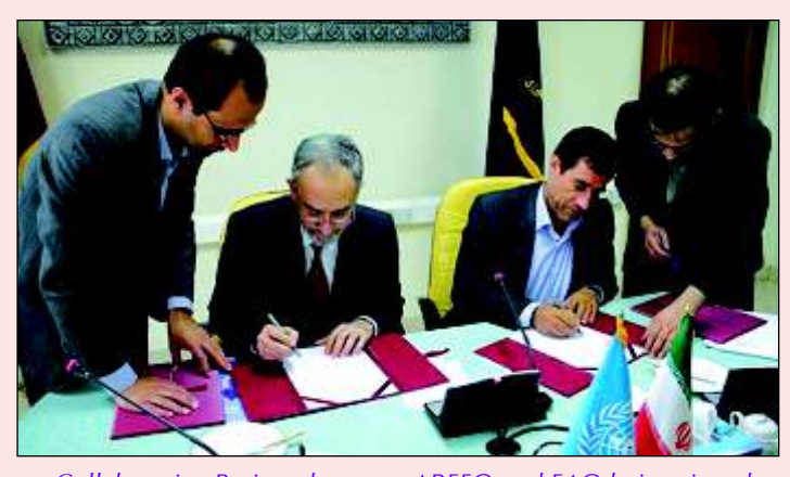
Collaborative Projects between AREEO and FAO being signed

The second project, "Optimizing the Use of Plant Genetic Resources for Food and Agriculture for Adaptation to Climate Change", which will be simultaneously executed in Iran, Egypt, Jordan and Lebanon,