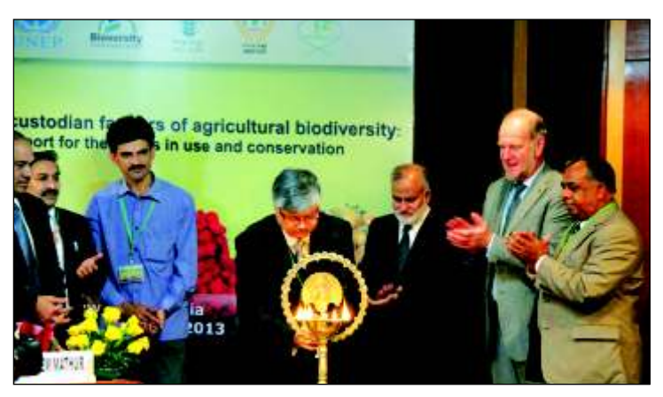
Dignitaries lighting the lamp during inauguration of workshop

In total, 20 farmers from five countries (India, Indonesia, Malaysia, Nepal and Thailand) participated in the workshop. Farmers from India came from eight different states, including a woman farmer from the State of Tamil Nadu. The group included a farmer who maintains 135 rare farmer varieties of mango within his orchard, a farmer who has gathered over 80 varieties of rice, and a farmer who experiments with and cultivates a wide range of tuber crops and vegetables at his home in Nepal. Many farmers in the group have domesticated wild tree species of Garcinia and Mangifera , including some farmers who have developed varieties that grow in sandy soils.