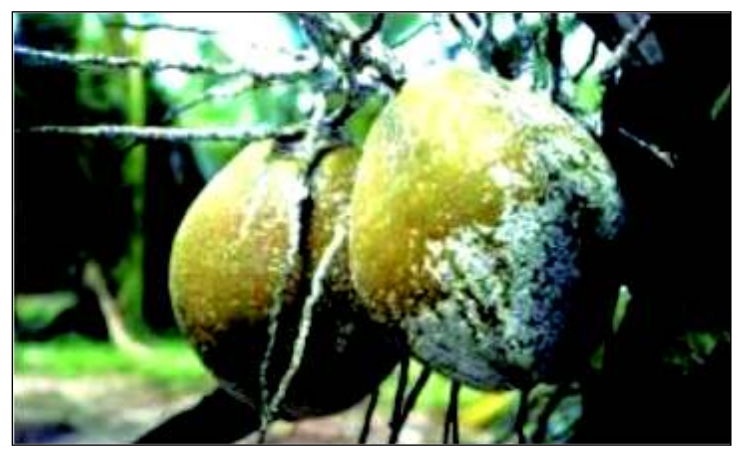
CSI infestation on coconut

Coconut plantations in Batangas attest to how menacingly destructive CSI can become. Having been first noticed in three barangays of Tanauan in 2011, CSI has spread in nearby coconut farm towns of Sto. Tomas, Laurel, Malvar, Lemery, Agoncillo, and Balete. Recent report shows that CSI has now affected about 780,000 coconut trees in nine municipalities of Batangas including nearby provinces, Laguna, Quezon, and Cavite. The havoc caused by the pest was enough for the affected communities to declare a state of calamity. Farmers were forced to cut down infested trees and sell them as lumber to mitigate losses.