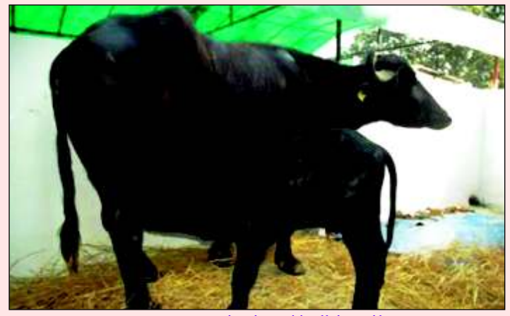
Swarn: A male cloned buffalo calf

to decrease the gap between the demand and supply of these bulls in the shortest possible time.