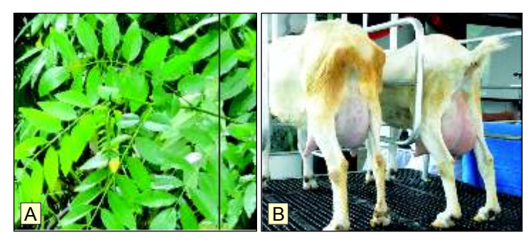
A. The legume tree "Indigofera" B. Milking goats at AGF are fed with diets supplemented with Indigofera

Indigofera tinctoria was reportedly first introduced, propagated, and promoted in Bansalan, Davao del Sur by the Mindanao Baptist Rural Life Center sometime in the 1980s. Only a few ruminant raisers then took notice and valued it as a forage crop. Indigofera is a forage tree/shrub with many shoots bearing pinnate bright green leaves. Some plant the legume just to be part of a vast landscape, while others plant it for shade and windbreak. As feed, farmers initially cited the unpalatability of the feed material due to toughness of the leaves. Hence, the material remained unknown and was neither promoted nor became popular in the countryside.