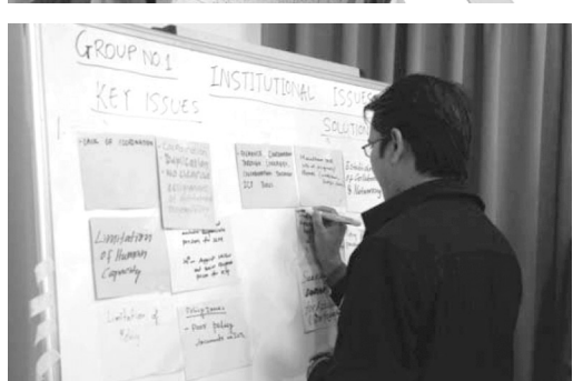
Group work in progress

The participants were divided into three groups to brainstorm on the issues related to opening access to agricultural information and knowledge and to prioritize solutions in order to identify suitable collective actions to be undertaken by different stakeholders in the plenary session. The three groups discussed critical issues and needed collective actions related to the themes 1) Institutional aspects, 2) Capacity building, and 3) Technical Issues and Technologies.