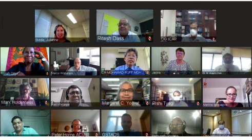
APAARI Executive Committee Meeting - P age 2