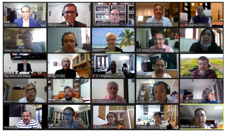
Participants of the consultation meeting

namely, from: Australia, Bangladesh, Bhutan, Fiji, Iran, Japan, Republic of Korea, Malaysia, Nepal, Philippines, Papua New Guinea, Samoa, Sri Lanka, Taiwan, Thailand, and Vietnam. They represented institutions belonging to NARS, universities, related ministries, and CG Centres. Twenty four per cent of participants were women scientists and experts.