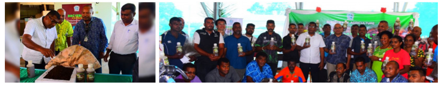
Hon. Minister for Agriculture Dr. Mahendra Reddy launching the product (left) and posing with farmers (right) who received the batch of Bacterium

Fiji's agriculture sector is largely driven by small-scale growers, which the Ministry of Agriculture (MOA) aims to develop into commercial scales that could automatically drive more inputs into production systems. "The introduction of organic agricultural inputs into Fiji's production system is the best option to ensure the sustainability of our natural resources", said Dr. Mahendra Reddy, Hon. Minister for Agriculture, when launching the Ministry's first ever formal production of the Bacterium Culture.