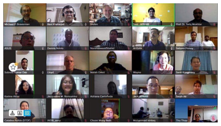
Participants at the Inception Meeting

Training of the Asia Pesticide Residue Mitigation through the Promotion of Biopesticides and Enhancement of Trade Opportunities