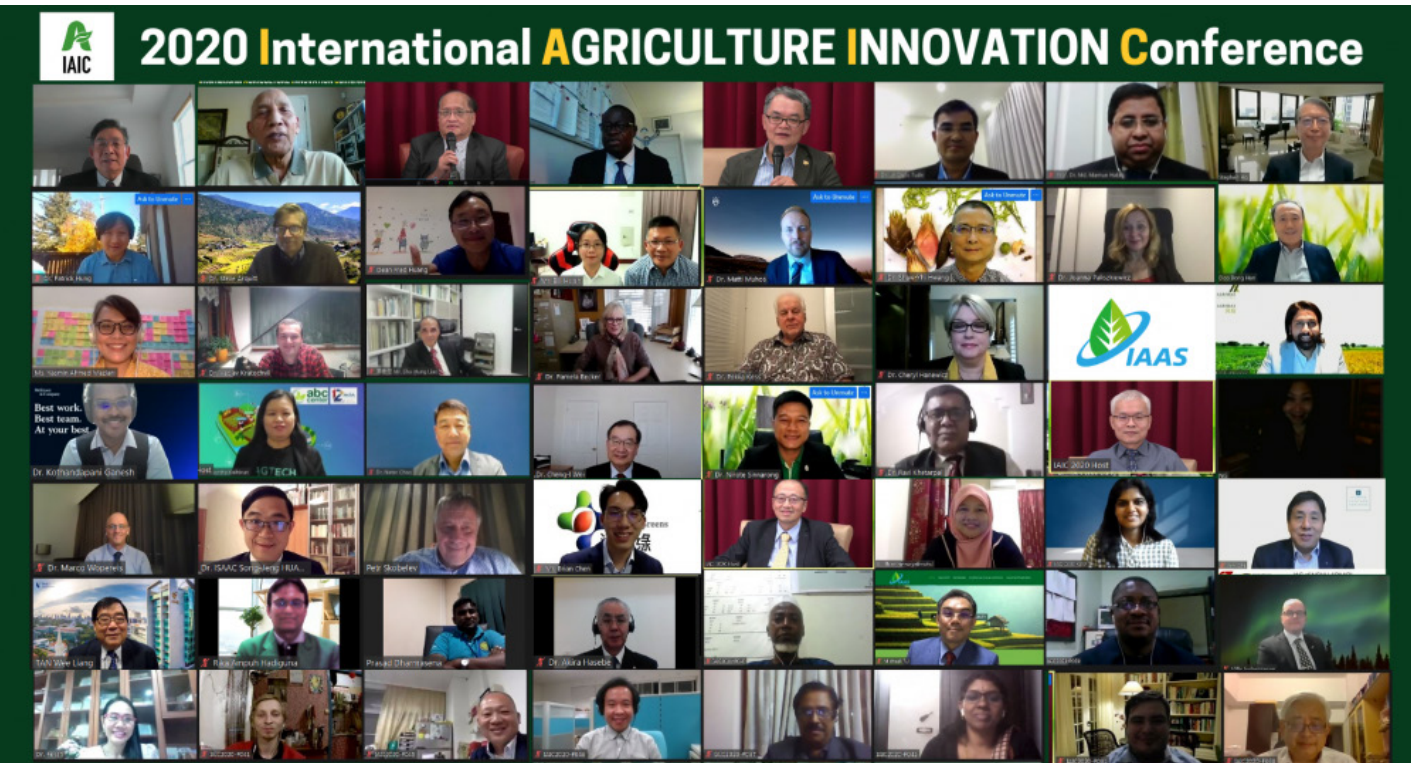
Participants of the four-day online innovation conference

Climate change intensifies global warming and crop production losses driven by the extreme climate and natural disasters. Since 2020, the globe has faced a challenge – COVID-19 pandemic. The outbreak has seen declines and stagnation of food trading and transportation between nations, which raised attention to the global supply chain.