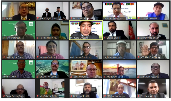
Regional consultation participants

Lack of focus on technological productivity, value chain inefficiency, and low investment are the significant challenges faced by agricultural R&D in South Asia – home to nearly 1.74 billion people. The region is projected to grow by 2.04 billion in 2030 according to United Nations' estimates, displaying a serious challenge on food security and achieving the SDGs.