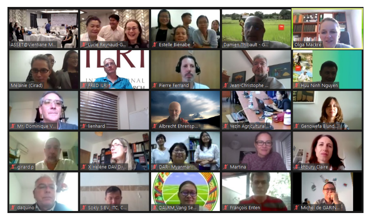
Regional partners and participants during the inception meeting

In 2020, APAARI signed a Consortium Agreement for the project on Agroecology and Safe Food System Transitions (ASSET) in Southeast Asia. The five-year project is funded by the European Commission and French Development Agency (AFD), and implemented by the Agricultural Research Centre for International Development (CIRAD) and partner organizations. Twenty-seven organizations from Cambodia, Laos, Myanmar, and Vietnam, as well as regional partners, such as APAARI, are partners in the project.