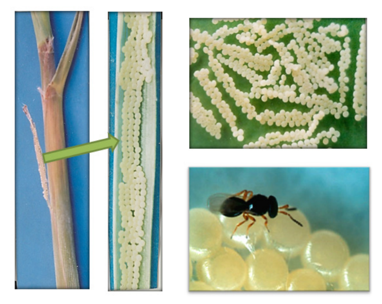
Figure 2. The egg mass of the sugarcane stem borer, Sesamia nonagrioides and its egg parasitoid wasp, Telenomus busseolae

Nevertheless, according to the latest findings of the Iranian Research Institute of Plant Protection, mass rearing of the high quality parasitoid wasp, T. busseolae is now possible. This is possible with a lower cost and time-savings using a newly-developed semi-artificial diet for mass rearing of the larvae of sugarcane stem borers under controlled conditions (See Figures 3 and 4).