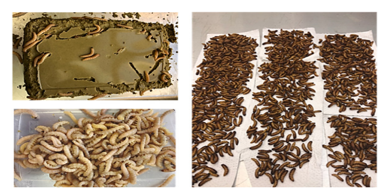
Figure 3. Mass production of the larvae and pupae of the sugarcane stem borer, Sesamia nonagrioides by using semi-artificial diet

Moreover, it provided a better condition for conservation of native natural enemies in Iran's sugarcane fields, and has