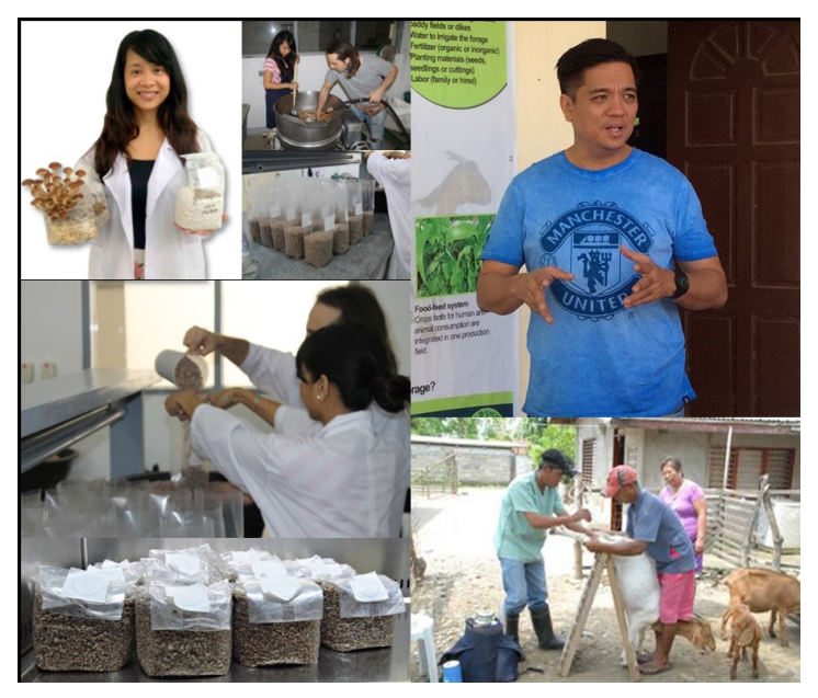
1<sup>st</sup> National Conference of the Agri-Aqua Technology Business Incubation (ATBI) Program

Technology commercialization is a process wherein private entities are licensed to mass production and sale of products or technologies. After officially graduating as an incubatee, the entrepreneur develops his/her own start-up or spin-off company, which is still supported by ATBI.