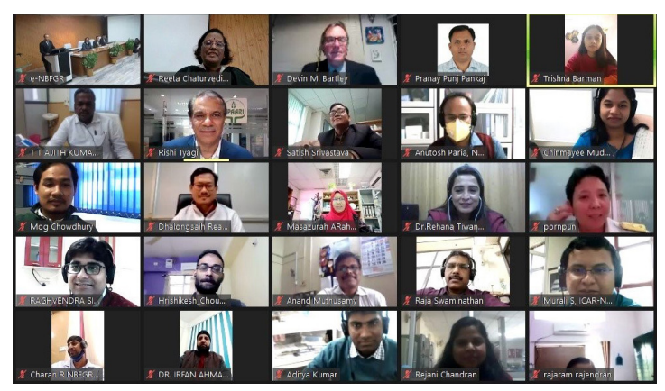
Participants of the capacity-building programme

Regional Capacity-Building Programme on Biotechnological Tools in Aquatic Genetic Resource Management and Ex Situ Conservation