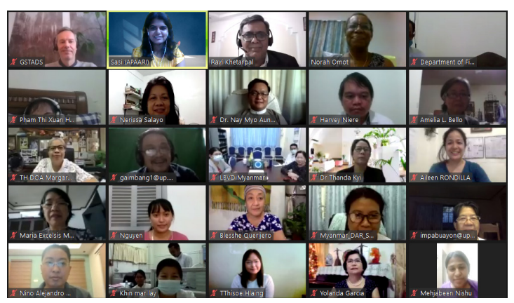
Participants of the regional webinar

In the strategic partnership with the International Food Policy Research Institute (IFPRI), APAARI is leading the ASTI project in the Asia-Pacific region. The APAARI/IFPRI team working on ASTI has collected, analyzed and provided data and information on the structure, status, funding, and focus of agricultural research performers in low-and middleincome countries in Southeast Asia. The data allowed for comparative analyses across countries, regions and globally. A large number of international organizations, as well as national-level decision makers around the world have been using ASTI data and analyses to assess agricultural research in developing countries, and to influence policy for increased agricultural growth and productivity.