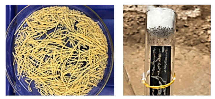
Figure 4. Mass production of the sugarcane stem borer, Sesamia nonagrioides eggs (left photo) and its egg parasitoid wasp, Telenomus busseolae (right photo) by using semi-artificial diet, (Original, photographs by Ranjbar Aghdam)

eliminated secondary pest outbreak, e.g., favorite activity of predatory coccinellid, Stethorus gilvifrons (Mulsant), as the most important natural enemies of the yellow sugarcane mite in Khuzestan sugarcane fields. Consequently, sugarcane production is currently based on developing biological control programme without using chemical insecticides to control sugarcane stem borers in Iran's sugarcane fields.