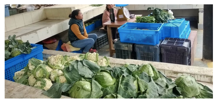
Figure 1: Dungna FMG selling their produces in Thimphu

FMGs are a type of service providers to farmers. FMGs can also undertake value addition, processing, packaging and branding of products wherever feasible. They are entrusted