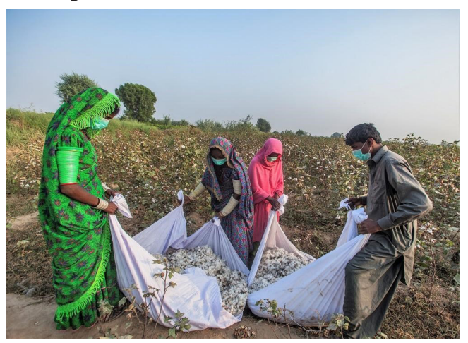
Cotton is sorted on a farm during harvest in the district Matiari, Sind province, Pakistan

Cotton is Pakistan's largest industrial sector and remains a key livelihood source for more than one million farmers. CABI in Pakistan is set to impact over 52,956 cotton farmers and nearly 105,248 workers with training and knowledge sharing workshops. Between now and 2025, CABI will help promote integrated pest management, improve food security, empower women and benefit the environment, consequently improving income and reducing losses.