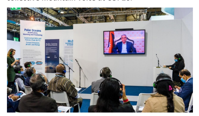
The Right Honourable Sher Bahadur Deuba, Prime Minister, Government of Nepal, delivers the opening remarks and acknowledges the relevance of the Mountains of Opportunity investment framework; Photo: Udayan Mishra/ICIMOD

In a high-level event at the 26th session of the Conference of Parties (COP26), ICIMOD introduced the 'Mountains of Opportunity' – an investment framework to enable partners to identify, align and scale up investment in mountain-specific climate priorities. As one of the three key messages under ICIMOD's #HKH2Glasgow campaign started in December 2020, the investment framework has been introduced as an instrument to articulate a collective mountain voice at COP26.