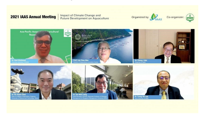
Speakers attending the 2021 IAAS Annual Meeting

International Association for Agriculture Sustainability (IAAS) conducted its Annual Meeting on 10th December 2021. Thought leaders, change makers, researchers, and industry professionals participated in various discussion primarily addressing the critical issues caused by climate change on aquaculture. The discussions ended with notable take-aways and recommendations.