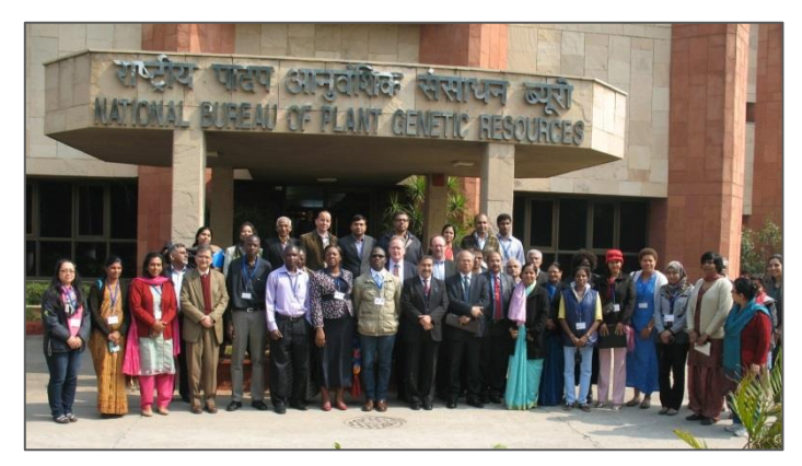
Participants of the Training Course

An international training course on 'In Vitro and Cryopreservation Techniques for Conservation of Plant Genetic Resources was organized from 17 - 28 February, 2014 at National Bureau of Plant Genetic Resources (NBPGR), New Delhi in collaboration with Indian Council of Agricultural Research and Bioversity International. This is fourth such training program organized by APCoAB for APAARI member organizations. In this course, nominees from MARDI, Malaysia; SLCARP, Sri Lanka and DOA, Thailand, besides 13 other national and international trainees, participated.