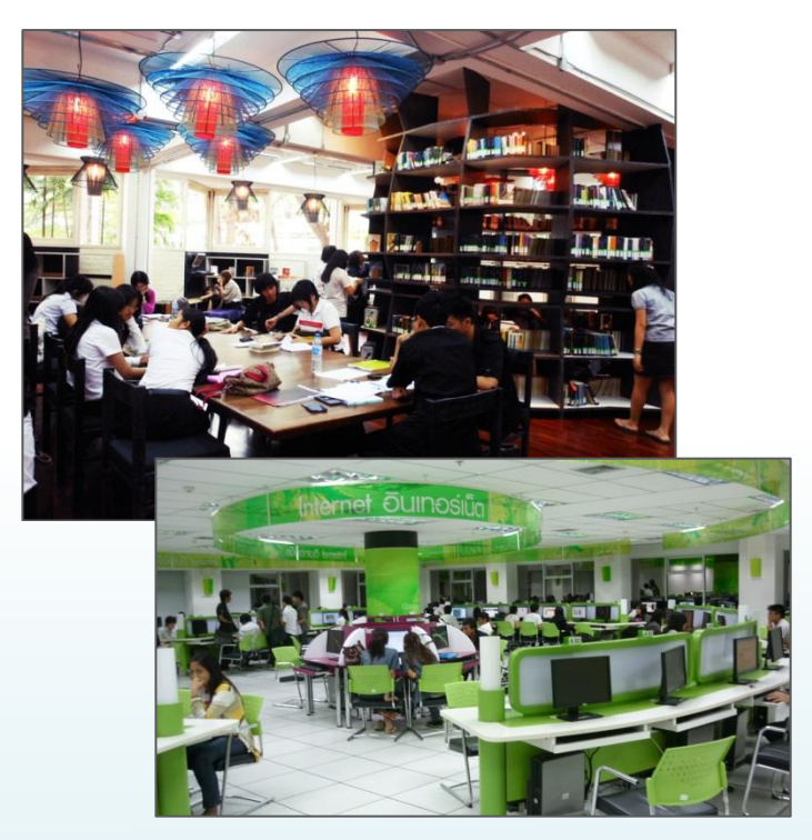
The green digital library focuses on energy saving and environmental conservation