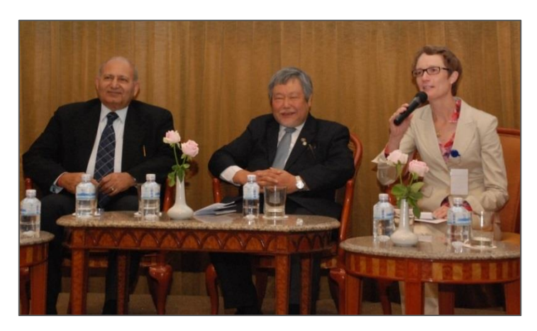
Closing Session of the Expert Consultation

There is a need to reorient the institutional capacity of extension systems to better align with the change in research focus towards climate-smart agriculture and sustainable practices. The paradigm shift from input-intensive to knowledge-intensive agriculture needs to go hand-in-hand with promoting innovative thinking in extension systems to focus on diversified farming systems, and sustainable value chains and industries.