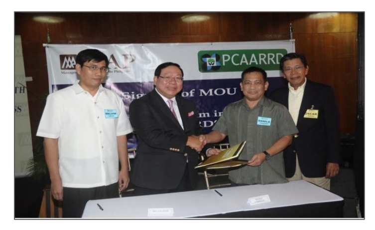
Signing of MOU

In the MOU, MAP is expected to: i) encourage MAP members to be business partners of PCAARRD in commercializing the Council's research outputs on agri-based products; ii) assist PCAARRD in developing the program for a "Matching Forum" in 2014; and iii) Support PCAARRD in the conduct of all information campaign activities related to commercialization of research outputs.