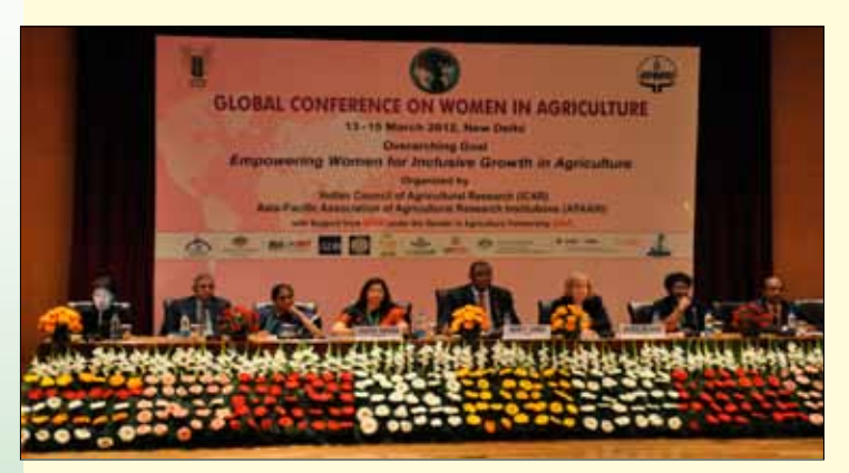
A Plenery Session in Progress

The overarching goal of the Conference was Empowering Women for Inclusive Growth in Agriculture. The Conference objectives were: i) to discuss and deliberate the prevailing and emerging gender issues in agriculture, ii) to take stock of evidence on experiences in enhancing role of women in agriculture, iii) to understand the mechanisms and approaches adopted by various organizations and countries, and iv) to ensure that policy initiatives are gender sensitive and there is a Framework for Action