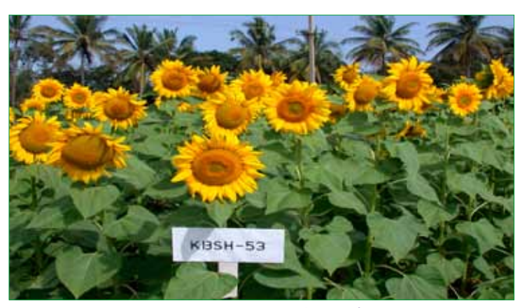
KBSH: A Promising Hybrid of Sunflower