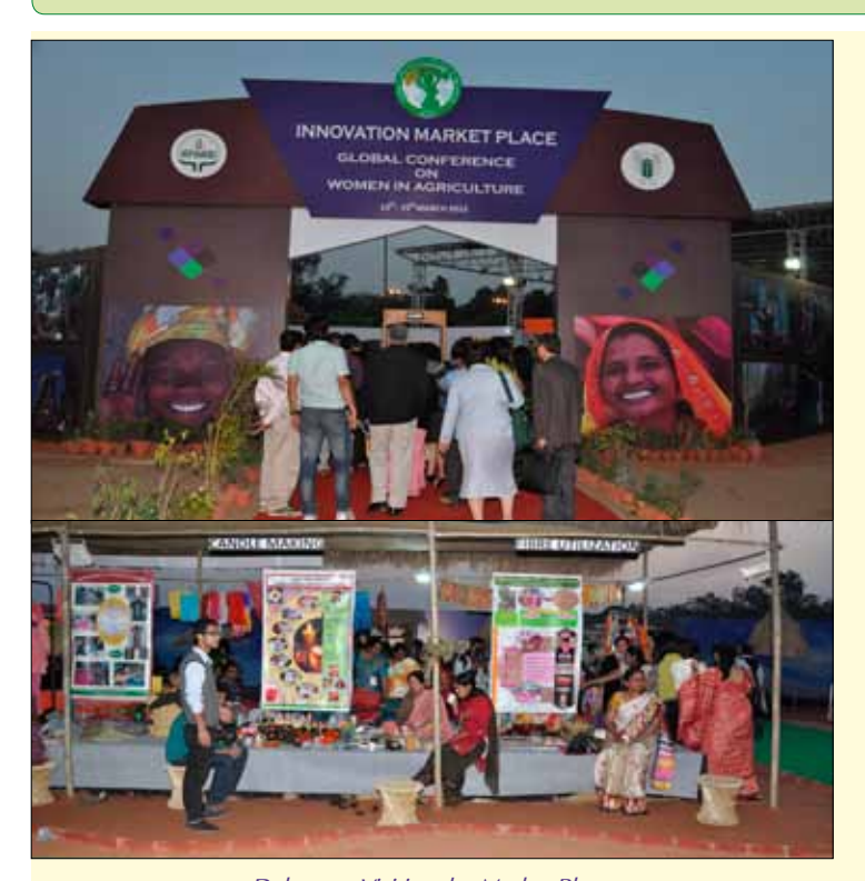
Delegates Visiting the Market Place

Linking women, agriculture and nutrition requires multi-sectoral thinking and action to address major nutritional deficiencies that continue to hamper children's development around the world. It requires institutionalization of research and extension through joint decision making that involves women themselves in participatory approaches.