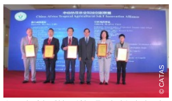
Launch of the China-Africa Tropical Agricultural S&T Innovation Alliance

Representatives from the Chinese Academy of Fishery Sciences, Nanjing Agricultural University, Jiangxi Academy of Agricultural Sciences and other Chinese members attended the ceremony. So far, 12 Chinese agricultural institutions and universities and 13 national units from 10 African countries have applied for membership.