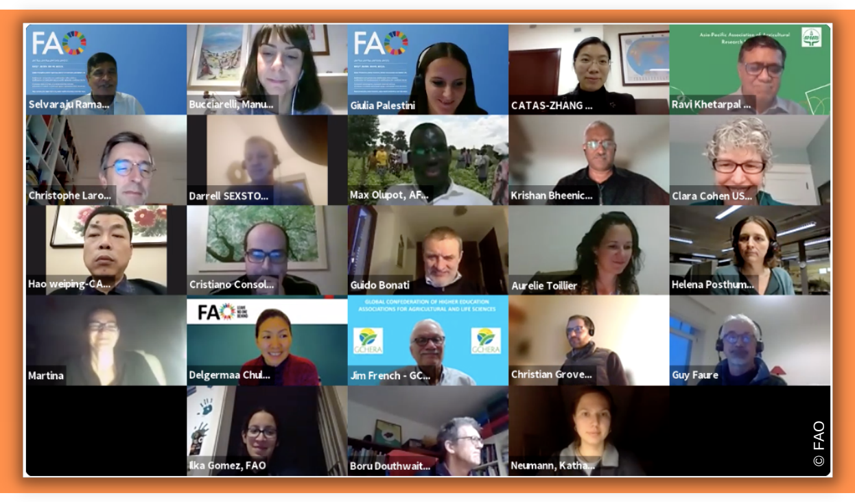
Group picture from the 8th TAP Partners Assembly