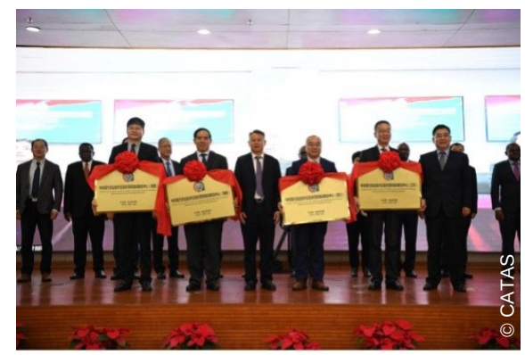
Launch of the 4 China-Africa Joint Centers

On December 15, 2021, the Chinese Academy of Tropical Agricultural Sciences (CATAS) held the opening ceremony for the first group of four "China-Africa Joint Centers for Modern Agrotechnology Exchange, Demonstration and Training". The launch of the four China-Africa Joint Centers in China aims at implementing one of the nine programs declared by President Xi Jinping at the Forum on China-Africa Cooperation (FOCAC) and marks an important step in the poverty reduction project. The first group of these centers includes CATAS, the Freshwater Fisheries Research Center of the Chinese Academy of Fisheries Sciences, the Biogas Institute of the Chinese Academy of Agricultural Sciences, and the SCO Demonstration Base for Agricultural Technology Exchange and Training in the Yangling Demonstration Zone.