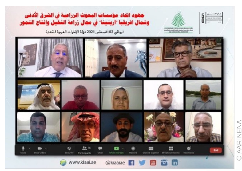
57 experts from 13 countries discuss date palm cultivation and production

AARINENA itself is currently working on the development and launch of a date palm innovation platform. The platform will serve as an information and knowledge hub that effectively connects various stakeholders (e.g., farmers, government and non-government service providers, policy makers, researchers, the private sector) and shares research results, technologies, available innovations related to the date palm production value chain.