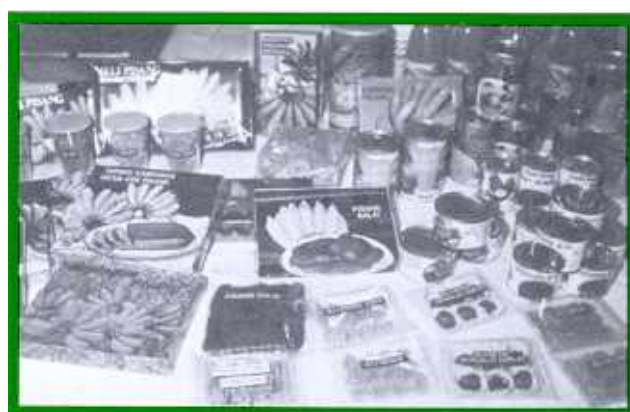
Food products developed by MARDI