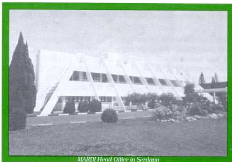
MARDI Head Office in Serdang

T he Malaysian Agricultural Research and Development Institute (MARDI) was established by an act of Parliament in 1969 to conduct research and Development (R&D) on all crops (except rubber and oil palm) and livestock (except in the area of animal health). MARDI is also entrusted to serve as a centre for specialist extension services and technical training of workers in the agricultural industry. Recently, MARDI has been mandated to undertake commercial ventures either solely or jointly with the private sector in order to promote the commercially viable technology.