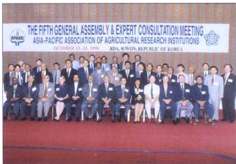
Participants of the Fifth General Assembly and Expert Consultation Meeting, APAARI