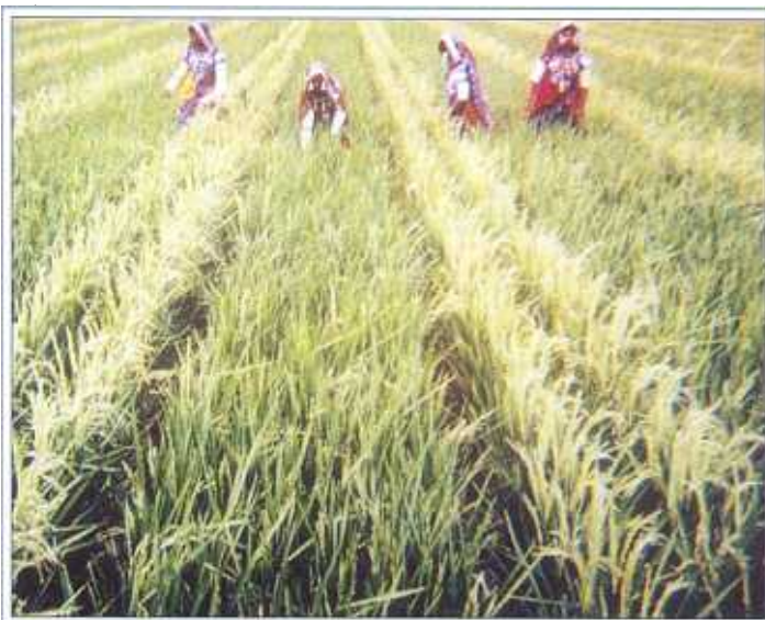
Hybrid Rice Field