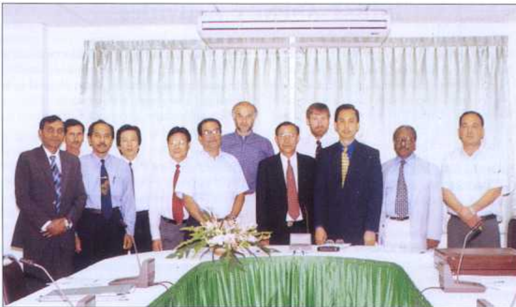
Participants of Fourth Steering Committee Meeting – UTFANET

will be finalised, to be submitted to IFAD with endorsement of APAARI.