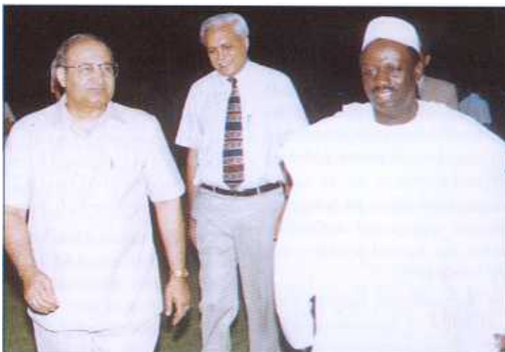
Mr. Jacques Diouf, DG, FAO visits National Academy of Agricultural Sciences, New Delhi

In the framework of World Food Day, I launched in October 1997 "Telefood", a televised appeal for global solidarity and support as part of the follow-up to the Summit. This year's edition of TeleFood will be held from 16 to 18 October. During these three days, TV programmes and broadcasts of related events will span the globe with images and information, highlighting women's contributions to the fight against poverty and hunger and urging solidarity to ensure food security for all. Last year, Telefood was watched by over 500 million people who learned about the scourge of hunger and malnutrition and responded by contributing more than US$ 2 million to help poor male and female farmers to produce more food, improve nutrition and family incomes to lead lives free from hunger. Currently, 159 Telefood small-scale projects provide tools, seeds or other essential supplies for food security activities in developing countries.