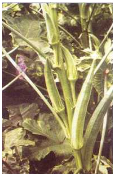
BARI Dherosh-1, A yellow vein mosaic virus resistant okra variety

Farmers of Bangladesh produce a wide range of vegetables on homestead and farmland under different agro-ecological settings. Some of the major constraints of the vegetable cultivation are lack of improved varieties, poor quality seeds and stress-summer environment. Bangladesh Agricultural Research Institute (BARI) attaches due importance on research relating to varietal development, quality seed production and off-season vegetable cultivation. The research programme had been strengthened with the creation of a Vegetable Division under Horticulture Research Centre of BARI. BARI has released 27 varieties of different vegetables which include yard long bean (1), leafy vegetables (6-kangkong, cabbage, Chinese cabbage, red amaranth, chinasak and batisak), peas (2), country bean (2), bush bean (1), radish (2), tomato (5), eggplant (1), bottle gourd (1), okra (1), onion (1), coriander (1), two hybrids of eggplant and one watermelon. Further, hybrids of tomato (2), OP variety of carotene rich tomato (2), eggplant (2), cabbage (1), cauliflower (2) and radish have been identified for release.