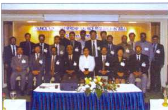
Participants at the Annual Meeting

The report on the status of rice research in each of the CORRA-member countries highlighted the common areas of interest. These include whole farm integrated management to increase profit and protect the environment, quality and post harvest, drought and water use efficiency, hybrid rice research and capacity building. The updates on and proposed activities of the International Network on Genetic Evaluation of Rice (INGER) were discussed and actions taken. During 27 years of its existence, INGER had developed 21,000 breeding lines and released 500 varieties in about 90 countries. The INGER was committed to free, safe exchange of rice germplasm and information for the overall development of this important crop. In its efforts to share the useful materials for genetic improvement of rice, INGER has developed its code of conduct as also its material transfer agreement (MTA). The members were apprised of IRRI studies on aerobic rice, application of GIS for