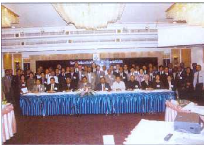
Participants at the Expert Consultation

The Sixth Executive Committee Meeting of APAARI and the Expert Consultation on Regional Priority Setting for Agricultural Research for Development in the Asia-Pacific Region were held at Bangkok, Thailand from 12-14 November 2001. In the Sixth General Assembly of APAARI and the Expert Consultation on "Strategies for Implementing APAARI Vision 2025: Agricultural Research for Development in the Asia-Pacific Region", held at Chiang Rai, Thailand, 8-10 November 2000, it was decided that APAARI should take a re-look at the regional priorities already identified/recommended for regional co-operation/partnership in R&D, so as to crystallize current ARD priorities in the region. As a follow-up of this decision, APAARI successfully completed the ARD Priority Setting exercise at the sub-regional level i.e. West & South-Asia (5-7 July 2001, at ICRISAT, India), East & Southeast Asia (27-28 June 2001 at IRRI, Philippines) and Pacific Island Countries (29-30 October 2001 at Fiji). The present Expert Consultation was therefore, planned to jointly discuss and collate the results of the three sub-regional meetings, streamline the regional priorities and to draw an action plan that focuses on poverty reduction, food security, better environment and overall