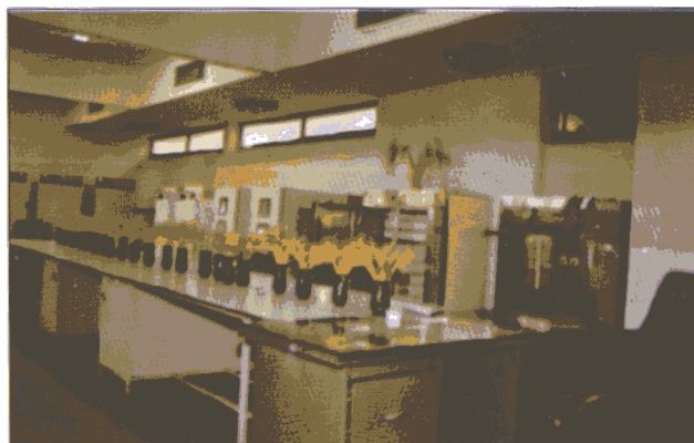
Seed Technology Laboratory