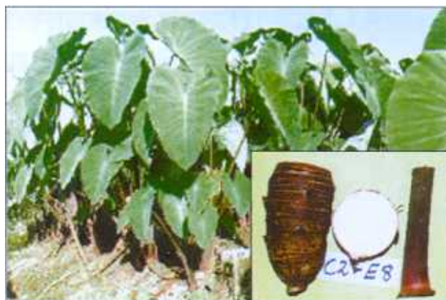
Taro breeding: developing new varieties

The 7 th International Sago Symposium entitled "Sago as Food and Renewable Resource for the New Millennium", was held at the Holiday Inn, Port Moresby from 27-29 June 2001. It was jointly organized by the Department of Agriculture and Livestock (DAL), PNG University of Technology, and the National Agricultural Research Institute (NARI). The symposium brought together renowned scientists from all over the world with a wealth of experience in their respective areas of speciality in sago research and development. Papers were presented from USA, Holland, Indonesia, Malaysia, Australia, Japan and PNG. Papua New Guinea has the largest natural stand of sago in the world and is believed to be the centre of diversity. In this context, hosting the symposium in PNG proved fruitful nationally for exploring more opportunities to develop sago as a commodity. The symposium recommended that sago palm genetic resources from different countries should be described for future use and breeding programmes, and that information on sago palm should be collected,