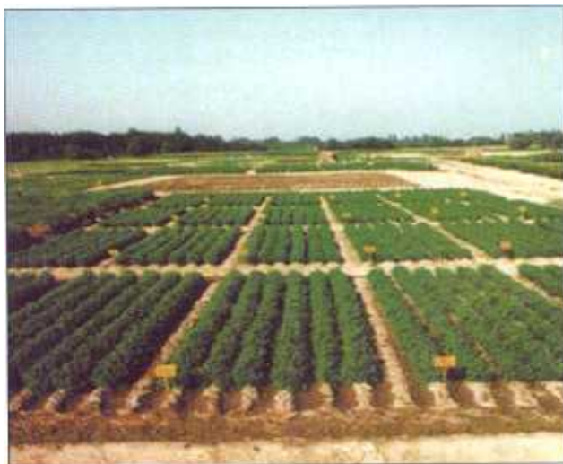
Evaluation of Iranian Lucerne Ecotypes

The activities of this department are based on the increasing demand for the seeds of recommended improved cultivars of different crops by the farmers. The department controls and supervises the seed