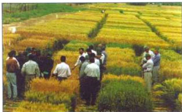
Scientists examining wheat-breeding experimental plots

This department was established in 1982 and is responsible for the collection and preservation of landraces and wild relatives of field and horticultural crops. As a routine activity, studies on taxonomical classification, genetic diversity and geographical distribution are being conducted. In addition, the germplasm are evaluated for their potential as sources of various economical traits as well as resistance to biotic and abiotic stresses. The department has very close collaboration with IPGRI in its international efforts for conservation of genetic resources.