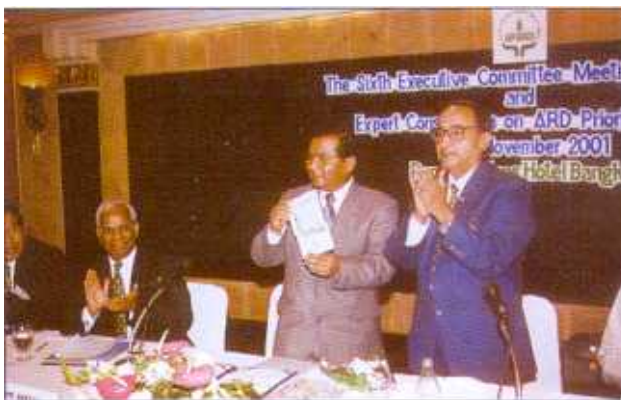
Release of APAARI Success Stories – CD ROM by the Chief Guest, Mr Pramote Raksarast

The meeting was inaugurated, on behalf of the Hon'ble Minister of Agriculture and Co-operatives, Royal Government of Thailand by Mr Pramote Raksarast, Deputy Permanent Secretary, Ministry of Agriculture. Mr Raksarast, conveyed the message of good wishes of Hon'ble Minister of Agriculture and Cooperatives, Royal Government of Thailand, for the success of the Expert Consultation. The diverse representation and a bottom up approach of APAARI in setting the ARD priorities were mentioned as instrumental to meet the challenges of poverty, malnutrition and food