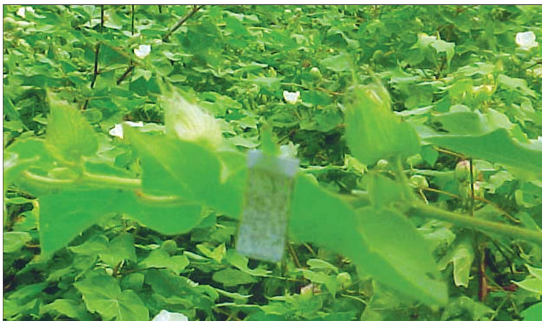
Figure 11. Use of Tricho cards - an integral part of IPM followed in cotton pest management.