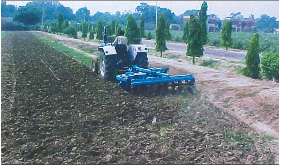
Figure 4. Land preparation with tractor drawn disc plough useful in reducing time between harvesting and planting in CWPS.