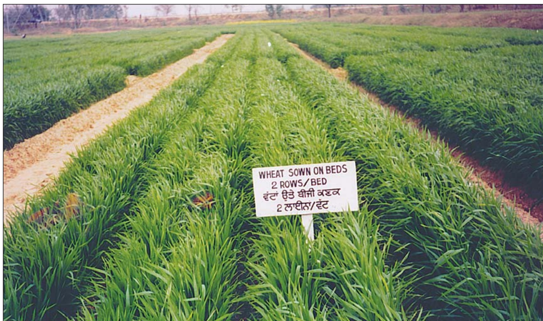
Figure 9. A successful lush green wheat crop raised on beds.