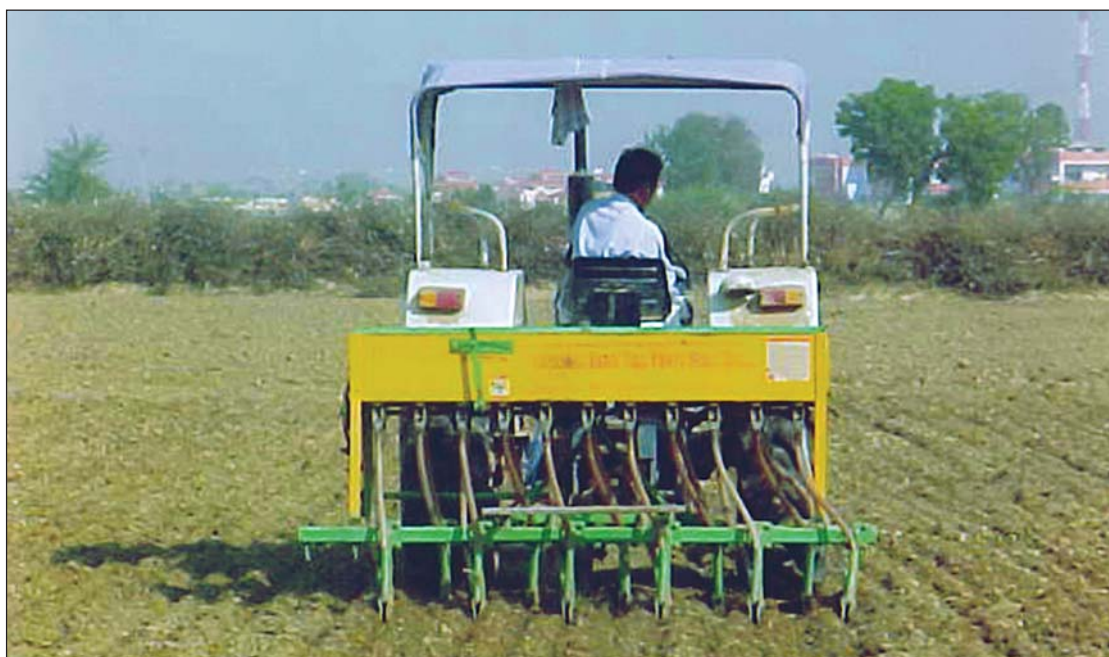
Figure 7. Zero-till planting of wheat: a resource conservation technology extremely useful in CWPS.