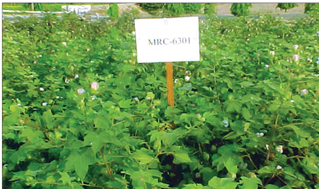
Figure 2. General view of Bt-cotton hybrid MRCH 6301 cultivated in north-western plains of India.