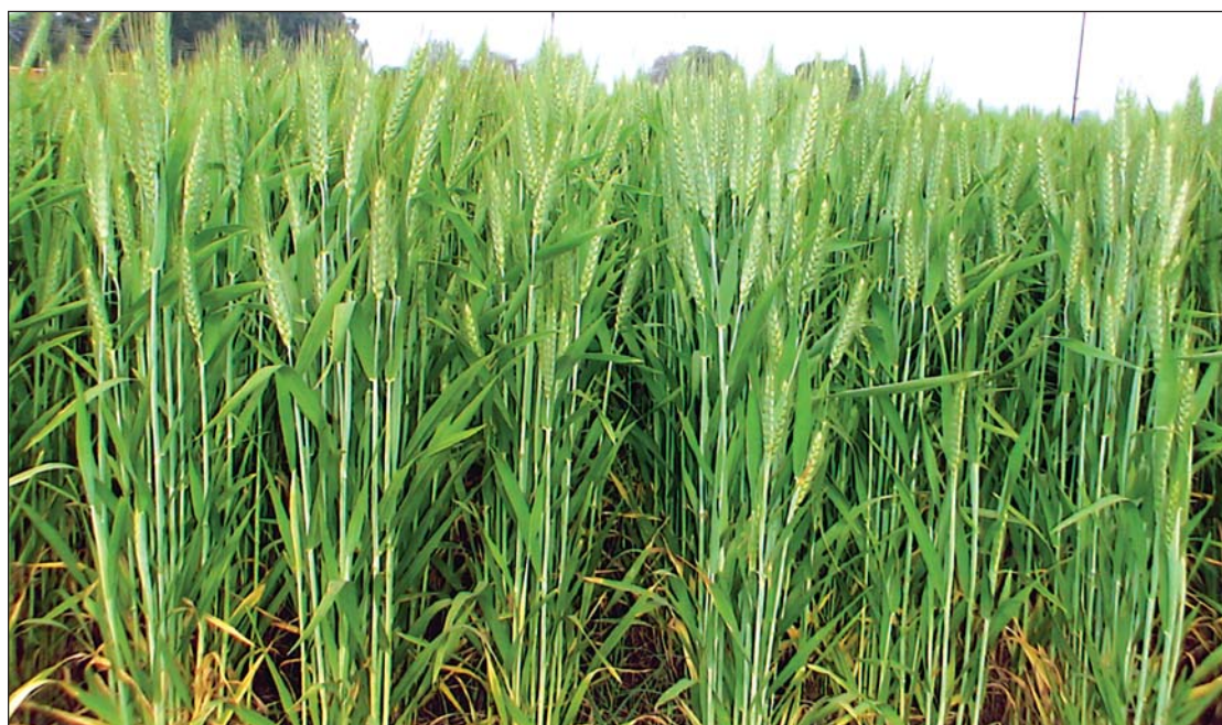
Figure 3. Rust-resistant wheat variety PBW-343: Highly popular in the cotton-wheat rotation in north-western plains of India.