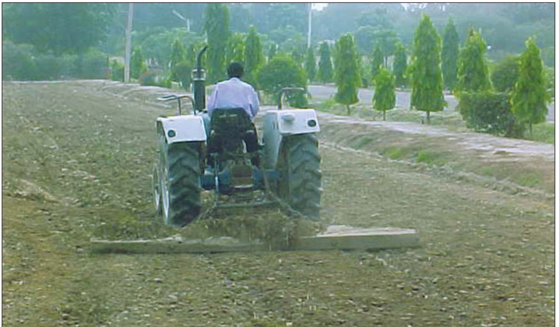
Figure 5. Tractor drawn planking operation as a part of quick land preparation.