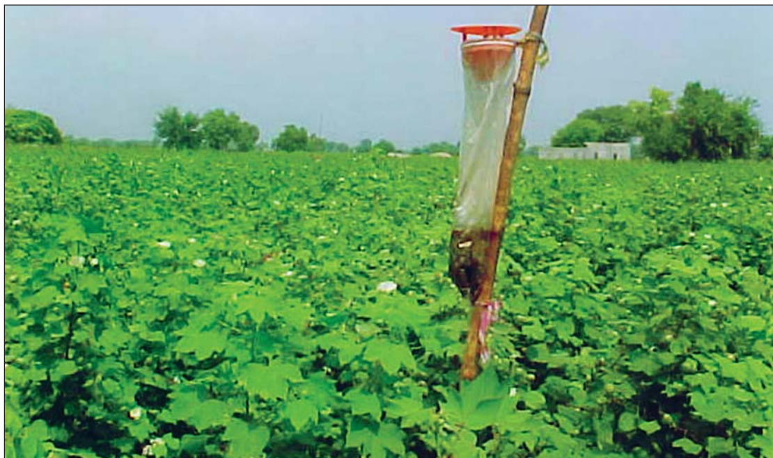
Figure 10. Pest surveillance in cotton through pheromone traps: a common practice in CWPS.