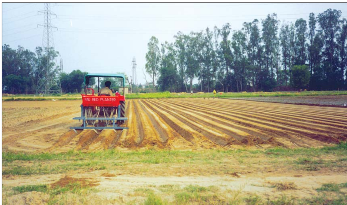
Figure 8. Mechanical bed preparation for simultaneous operations of tillage and sowing useful in cotton and wheat cultivation.