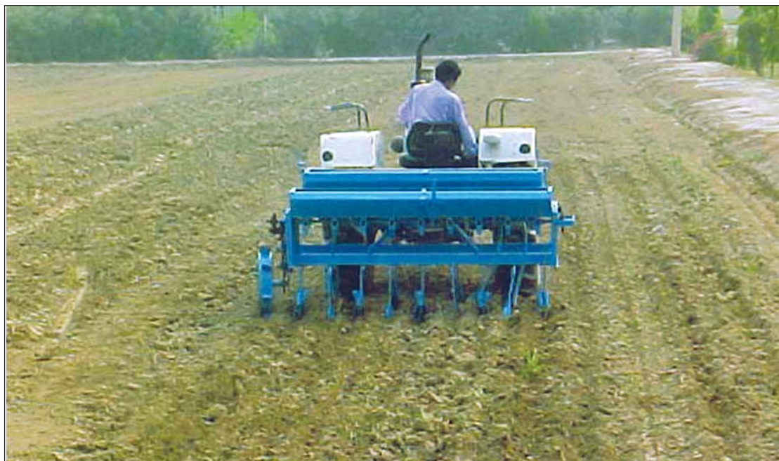
Figure 6. Mechanized planting of cotton widely adopted in CWPS.