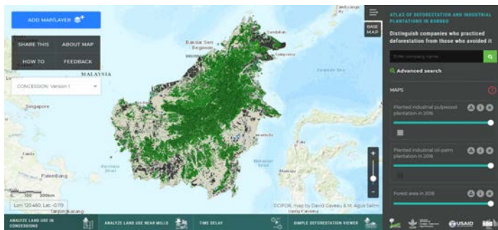
The latest version of the Atlas of Deforestation and Industrial Plantations in Borneo

The idea is to offer the opportunity to investigate to what extent plantation companies have cleared forests in Borneo, and to what extent they have avoided forest loss by planting on non-forested lands. Understanding where companies practice sustainable planting is key to engaging and promoting positive actions by companies.