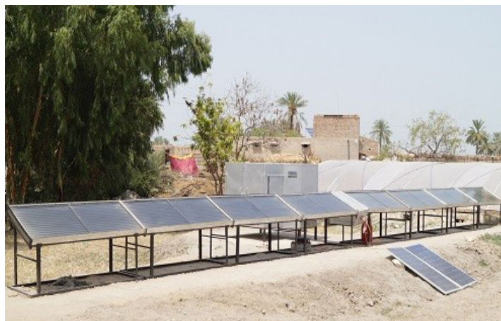
Figure 1: Solar-cum-gas fired date dryer

The solar-cum-gas Fired Dates Dryer is comprised of eight flat plate solar collectors, a drying chamber, 250-watt axial flow fan, 500-watt solar PV panels, inverter, two batteries, jet gas burner and LPG cylinder to make the system hybrid. The axial flow fan is placed between solar collectors and drying chamber, which is comprised of two small tunnels. The hot air produced by solar collectors is circulated in the drying chamber with help of axial flow fan.