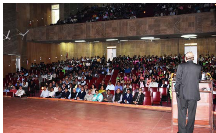
VC addressing staff on University Foundation Day