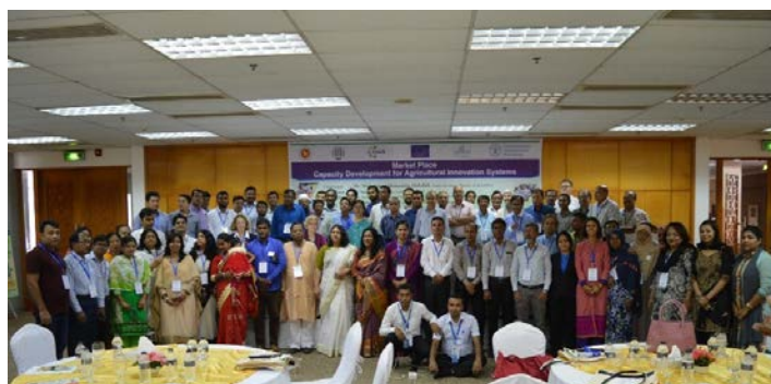
Participants of the CDAIS, Marketplace, Dhaka, Bangladesh

APAARI participated in the event and shared a poster showing its contribution to TAP and alignment with CDAIS activities.