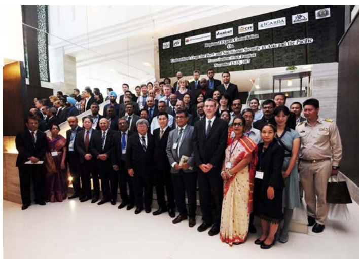
Participants of the Regional Expert Consultation on Underutilized Crops for Food and Nutrition Security in Asia and the Pacific

emerged that policy makers should be approached to give due attention, generate political will and mobilize funding and subsidies, and promote greater use of these plants. This would require a comprehensive knowledge-sharing system on crops, experts, as well as centres of excellence for capacity building, networking and multi-stakeholder partnerships. Another requirement would be facilitation of germplasm exchange, along with the collection, characterization and evaluation. For this, a global funding system for scholarships, exchange, and projects need to be emphasized, along with awareness generation programmes.