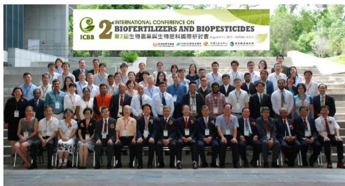
Participants of the 2 nd International Conference on Biofertilizers and Biopesticides