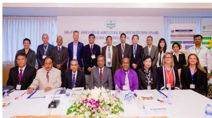
Participants of the 1 st APAARI Executive Committee Meeting for 2017, Bangkok, Thailand

APAARI's first Executive Committee Meeting (ECM) for the year 2017 was held on 14 July 2017 in Bangkok, Thailand.