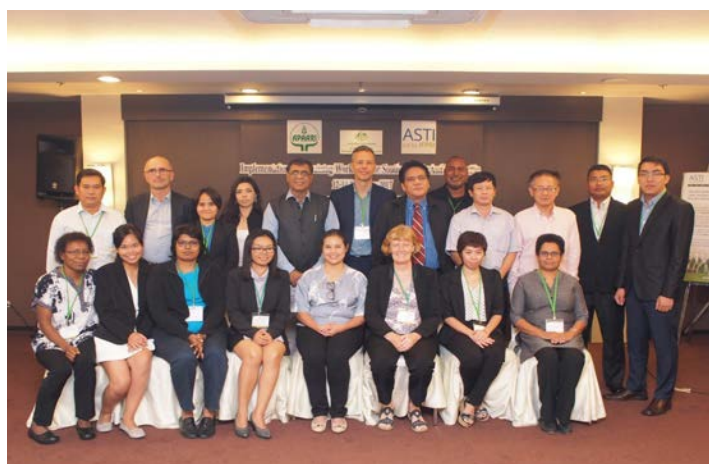
ASTI Workshop participants

APAARI and IFPRI are grateful to ACIAR for their support to