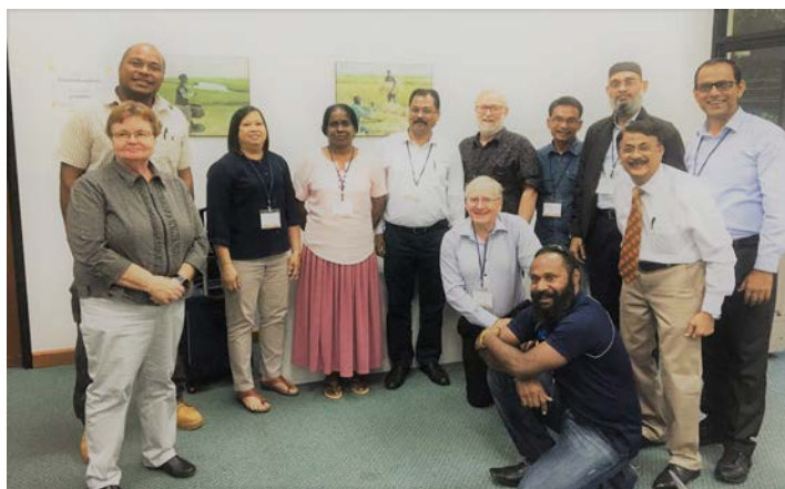
2 nd Crawford Fund master class participants