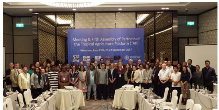
Participants of the Global Consultation Meeting 6, Vientiane, Lao-PDR

The participants also explored how to feed project results and the Common Framework developed under the CDAIS project into policy dialogue. All TAP partners attended the presentations and APAARI presented its role and purpose within TAP.