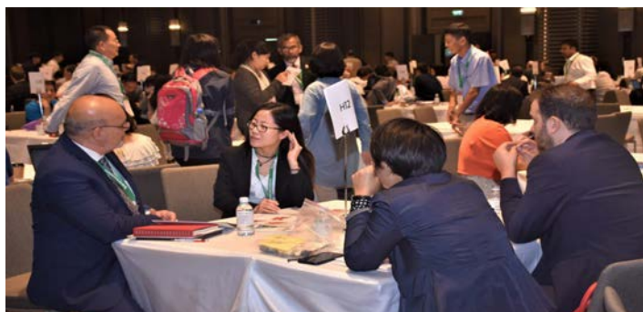
Most APSA members depend on the Asian Seed Congress for their business year-round

Among the nearly 2,000 stakeholders attending were more than 1,200 registered delegates, several hundred day-pass registrants, dozens of experts and VIP guests, including executives, scientists and government officers.