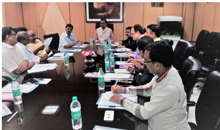
Participants of the consultation workshop