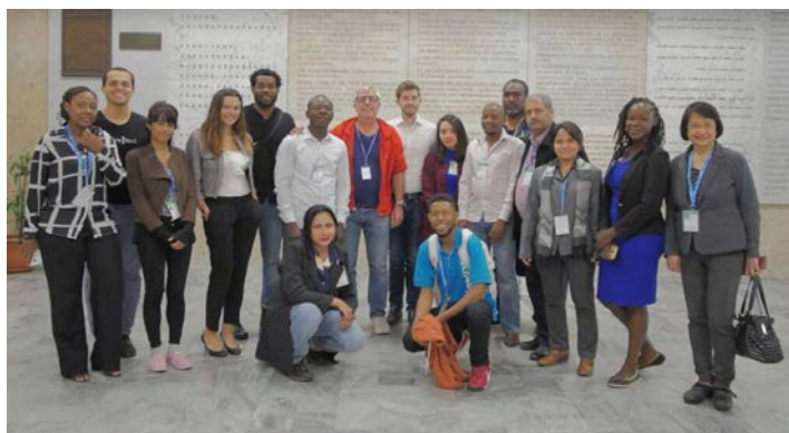
Social Media Reporters of the Committee on World Food Security CFS44

APAARI participated in the Social Reporting Training and reported on side events. This was through creation of blog posts, and promotion of the event on various platforms, such as Facebook, Twitter and LinkedIn. The event, organized several discussions ranging from climate change to the role of youth and women in agri-food research and innovation systems, food security and nutrition, forestry, and food diversity.