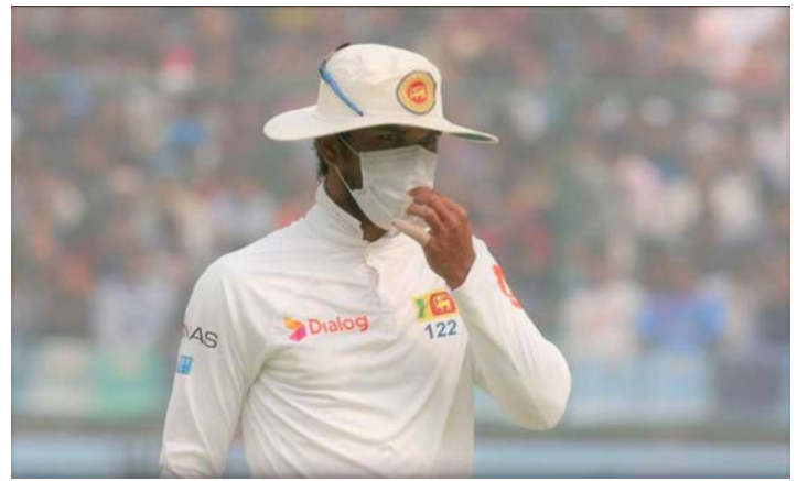
A cricket match in New Delhi was interrupted due to poor air quality

Importantly, the Turbo Happy Seeder is lighter than its predecessor and has reduced power requirements, allowing