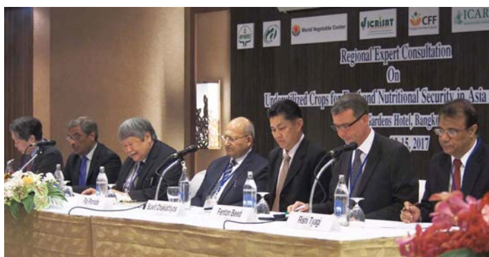
Inauguration of the Expert Consultation

A multi-stakeholder "Regional Expert Consultation on Underutilized Crops for Food and Nutrition Security in Asia and the Pacific" was organized by APAARI and the Council of Agriculture (COA), Taiwan, in collaboration with Bioversity International, Crops for Future (CFF), Department of Agriculture (DOA), Thailand, International Centre for Agricultural Research in the Dry Areas (ICARDA), International Crops Research Institute for the Semi-Arid Tropics (ICRISAT) and WorldVeg (The World Vegetable Centre), during 13-15 November 2017 in Bangkok, Thailand.