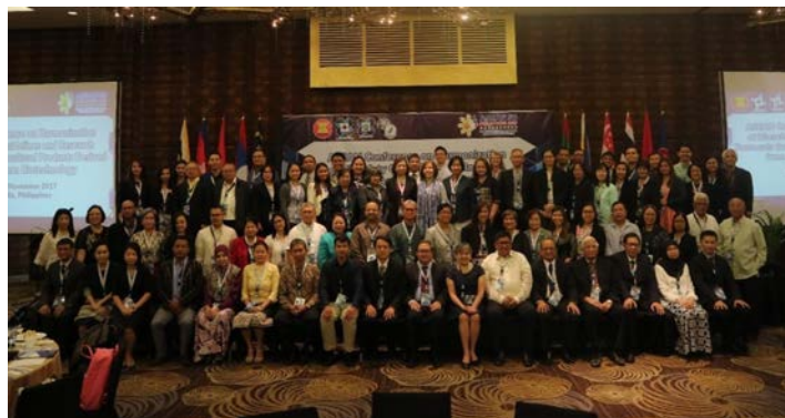
Delegates and participants of the ASEAN Conference on Harmonization of Biosafety Guidelines and Research Protocols for Agricultural Products derived from Modern Biotechnology, held on 27-29 November 2017, in Manila, Philippines.

Biotechnology experts and leaders in the ASEAN region, including the Philippines, gathered 27-29 November 2017 for the ASEAN Conference on Harmonization of Biosafety