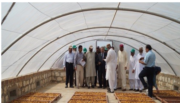
Figure 2: Solar tunnel date dryer

A SAARC-funded project entitled 'Postharvest management and value addition of fruits in production catchment in SAARC countries' is being implemented in the Khairpur and Sukkur District of Sindh Province.