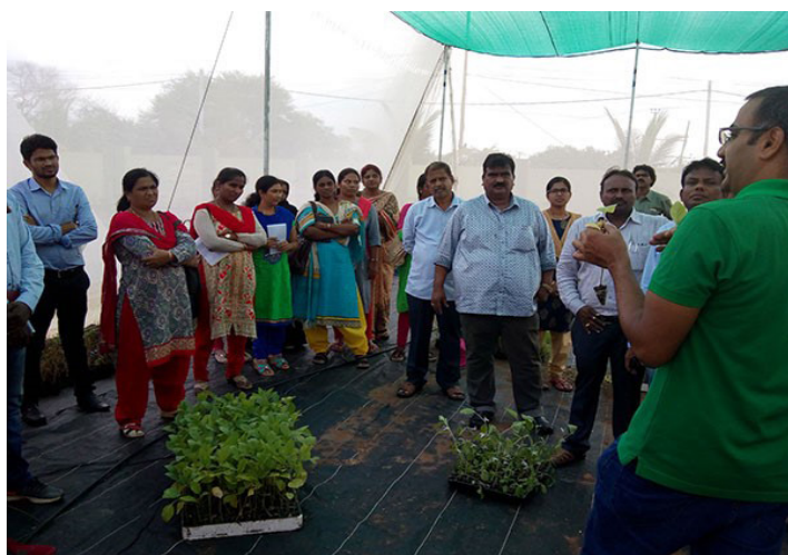
A practical discussion on how to take care of grafted seedlings