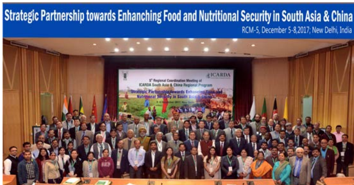
Participants of the 5th Regional Coordination Meeting

He acknowledged the germplasm received from ICARDA on pulses, cereals and fodder cactus, and mentioned that with the establishment of ICARDA's Research Platform in India, R&D deliverables will be enhanced to a new height for the benefit of the region, and also globally. The dignitaries lauded ICARDA's contribution to dryland farming systems through delivering climate-resilient technologies for farmers: on pulses, barley, wheat, and fodder, and small ruminants.