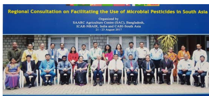
APAARI participated in SAARC Regional Consultation on Facilitating the use of microbial pesticides in South Asia

SAARC Agriculture Centre (SAC), Bangladesh, the Centre for Agriculture and Bioscience International (CABI)-South Asia, ICAR-National Bureau of Agricultural Insect Resources, Bengaluru, organized the Regional Consultation on 'Facilitating the use of microbial pesticides in South Asia' from 21-23 August 2017 in Bengaluru, India. APAARI participated in the meeting which stressed the importance of the utilization of microbial pesticides in SAARC countries; challenges with IPR, regulatory hurdles, political interference and duplication of research within and across the countries. A call was also made to develop climate-resilient biocontrol agents and genetic