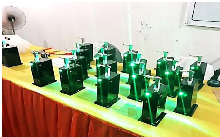
Rubber Nanosensors developed by DLSU

These included the Philippine Pioneer Rubber Products Corporation, STANDECO, Philippine Rubber Farmer's Association, Department of Trade and Industries-IX, Department of Agriculture Regional Field Office-IX, and Local Government Units of Kalawit, Godod, and Tampilisan, Zamboanga del Norte.