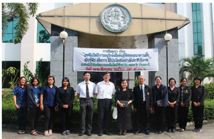
Participants of DOA Genebank, Thailand