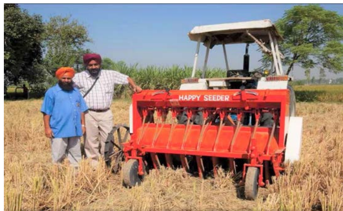
The ACIAR innovation, Happy Seeder

The most popular cropping system in South Asia—practised on about 13.5 million hectares across the Indo-Gangetic alluvial plain—is a monsoonal rice crop quickly followed by wheat. In north-west India, combine harvesting of rice and wheat is common practice but it leaves large amounts of crop residue in the field. While the wheat residue is used for animal feed, the paddy residue—rice straw—has no local economic uses and is agronomically problematic.