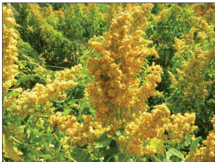
A field trial on quinoa (Chenopodium quinova)

ICBA employs modeling as well as analytical tools to assess land and water resources for different types of agricultural production systems and makes land resource management and reclamation recommendations while pursuing best management practices. This enables strategic planning in agricultural production systems, which requires sufficient knowledge of the availability of existing qualitative and quantitative resources. Similarly, ICBA carries out soil and water surveys, hydrological modeling, and exploration of sea water intrusions and impact on groundwater quality. Testing