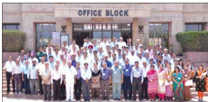
Participants of brainstorming workshop, New Delhi

In view of the above, a two-day brainstorming workshop on “Upscaling Quality Protein Maize for Nutrition Security” was jointly organized by the Indian Council of Agricultural Research (ICAR), Trust for Advancement of Agricultural Sciences (TAAS), National Academy of Agricultural Sciences (NAAS),