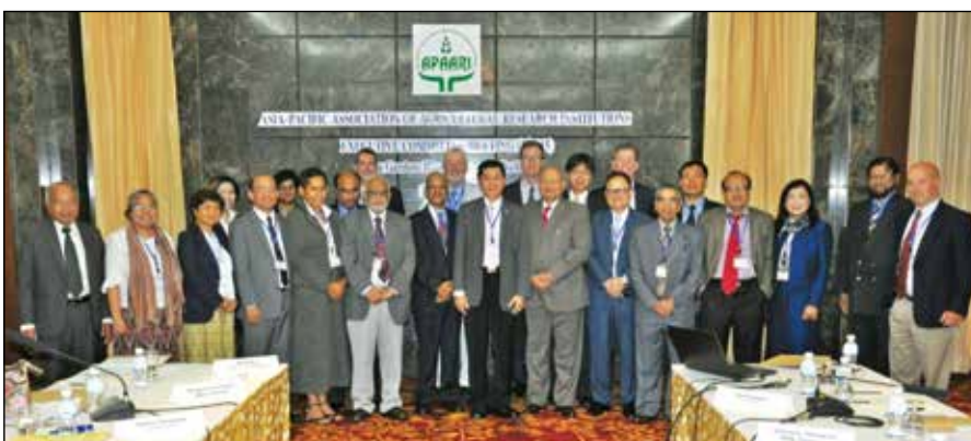
Participants at the APAARI Executive Committee Meeting, Bangkok, Thailand