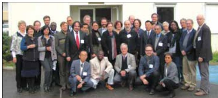
Participants of workshop, Montpellier

The discussion was organized around three main themes: (i) Elements of the Framework, (ii) Needs Assessment, and (iii) Monitoring and Evaluation. The Framework needs to deliver operational and practical guidance on CD for AIS at system and