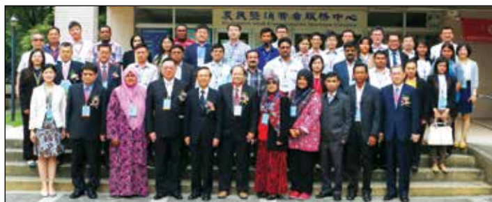
Participants of the training course

The Food and Fertilizer Training Center (FFTC), Asia-Pacific Association of Agricultural Research Institutions (APAARI), Council of Agriculture (COA), Chinese Taipei, and Taichung District Agricultural Research and Extension Station (TDARES)