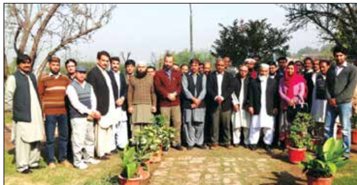
Participants of training workshop

Excessive irrigation application is the normal practice at the farms in Pakistan, which reduces crop water productivity and exacerbates waterlogging and salinity, thus challenging food security in the country. Suboptimal irrigation scheduling is considered to be one of the main reasons of excessive irrigation water losses on farms. In order to address these issues, a Training Workshop on Irrigation Scheduling Optimization through Soil Moisture Monitoring was organized by Climate