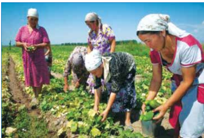
Women farmers harvesting fruits and vegetables in Caucasus and Central Asia

In finding solutions, the Global Forum on Agricultural Research (GFAR) has worked to ensure that civil society is actively engaged in dialogues on climate change and agriculture. Starting at the First Global Conference on Agricultural Research for Development (GCARD1) in France in 2010, GFAR has facilitated the voices of civil society in the development of plans and actions on Climate Smart Agriculture (CSA). This process