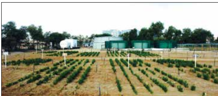
Field experiments on freshwater and brine-fed integrated aqua-agricultural system

Integrated aquaculture, based on marine and terrestrial agricultural systems, has great potential to boost income under marginalized conditions. ICBA's program on biofuel crops includes undertaking pilot programs and assisting with scaling up seawater-based agricultural systems and integrating marine and terrestrial culture systems for optimizing farm livelihoods. ICBA also analyzes policies and undertakes socioeconomic studies on food and nutrition security, and water and land management at various scales in marginal environments, to provide recommendations to national, regional and global