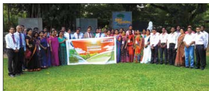
Participants of training course, Colombo, Sri Lanka

Ecosystems identification, protection and restoration will be looked upon as one of the major challenges in the 21st century to transform economies from industrial to green environmental economies, and to build resilient communities to withstand the challenges of global warming. In this endeavor, capacity building of communities, professionals and institutions has to be given high prominence.