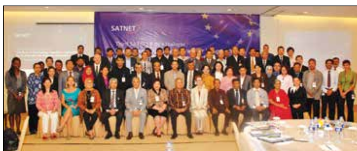
Participants of policy dialogue, Bogor, Indonesia

At the Rio+20 Conference in June, 2012, the global community renewed its commitment to freeing humanity from hunger and poverty as an indispensable requirement towards achieving sustainable development. At the same time, it underscored the importance of ensuring sustainable production patterns and protecting the planet's natural resource base. Realizing this commitment will be an uphill task, given the increasing demand for food due to a rising global population, as well as the challenges of land degradation, environmental contamination and climate change which pose a threat to maintaining even existing levels of crop yields.