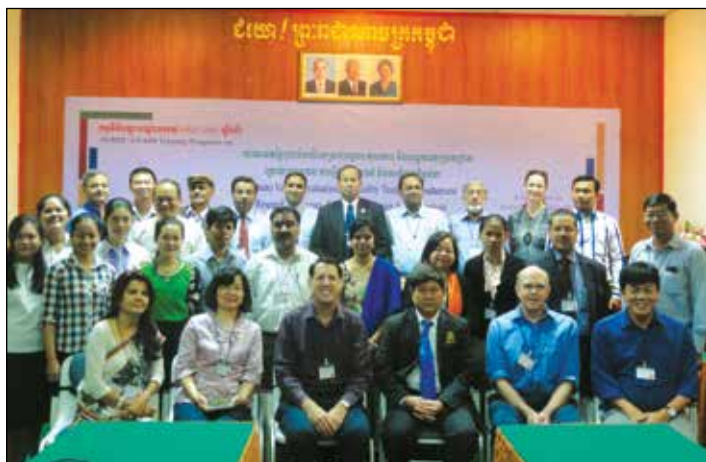
Participants of training workshop in Cambodia

Nepal, Cambodia, Pakistan, Thailand and India and was held at the Royal University of Agriculture in Phnom Penh, Cambodia.