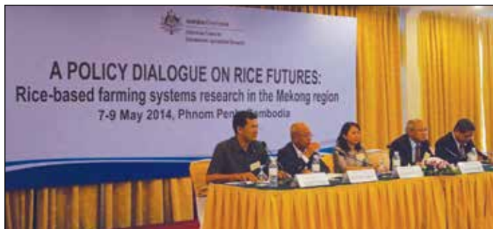
A policy dialogue on rice futures