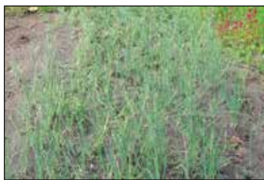
Aibika ( Abelmoschus manihot )