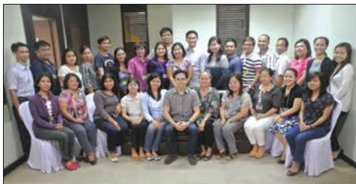
Participants of training course, PSRTI, Diliman Ruezon City

and Development Projects” recently at PSRTI in two batches of five day each. The training aimed to enhance the capacities and equipping the Council’s Network of implementers in conducting quantitative analysis.