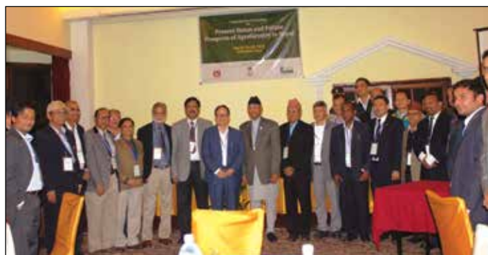
Participants with Hon'ble Minister of Forests and Soil Conservation, Mr Mahesh Acharya

A consultation workshop on "National Agricultural Policy for Nepal" was jointly organized by the Ministry of Agricultural Development (MOAD), Ministry of Forests and Soil Conservation (MFSC) of the Government of Nepal, World Agroforestry Centre (ICRAF) and the Asia Network for Sustainable Agriculture and Bio-resources (ANSAB) at Hotel